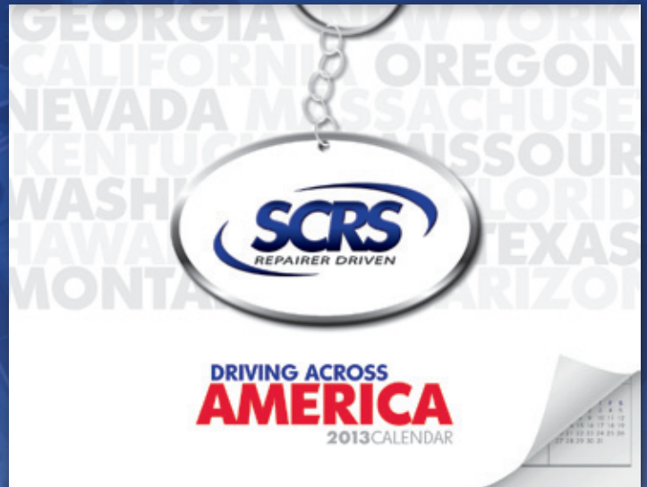
Driving Across America 2013 calendar 10.75" X 16.5" OPEN SIZE

Car owners are always looking for a repair specialist they can rely on. Make the search easy for them by keeping your shop name visible all year round with personalized SCRS calendars.